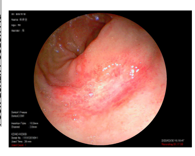
Figure 2 Duodenal ulcer was found in the procedure.

diodes (LEDs), 11.0-mm-diameter tube with 1300 mm length, 3.0-mm diameter channel, a 110° view angle, 180° bending angles for up, and 160° bending angles for down, left, and right each. The probe (scope) is manipulated by the controller that is connected to the processor (XZING-S2, Fig. 1C) with a viewer program (Fig. 1B). In ICU, the emergent endoscopy was performed and an ulcer was detected in the duodenal bulb (Fig. 2, Video S1). Esophagogastroduodenoscopy (EGD) is recommended in the early stage of GI bleeding, however, the study identified the receptor of SARS-CoV-2 (ACE-2) expressing in the GI tract and some researchers have isolated infectious virus from patient stool. 1,2 Therefore, the endoscope might be contaminated by digestive fluid which can spread the virus to the operator and cleaner. During the COVID-19 pandemic, the appropriate use of personal protective equipment (PPE) and simple barrier device can prevent SARS-CoV-2 infection in endoscopy units.<sup>3,4</sup> The use of a disposable endoscope is